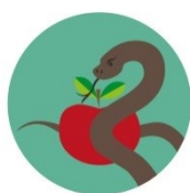
Adam & Eve (The Fall)