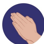
Zechariah & Elizabeth