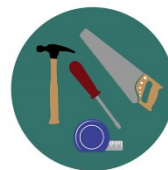
Joseph of Nazareth