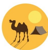
Abraham & Sarah